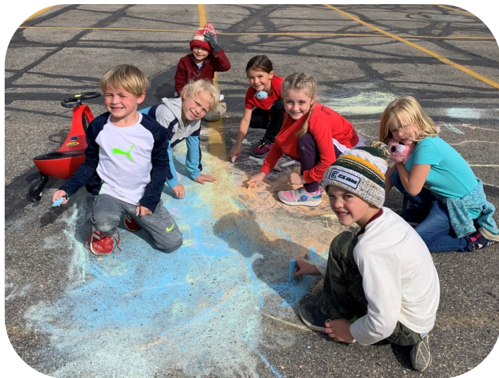
First grade chalk art.