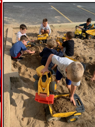
Above: Holy Rosary School Kindergartners working hard to level the sand on the playground during recess.